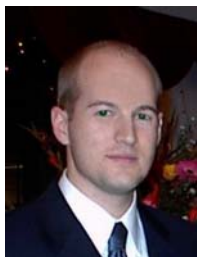
CPA, Licensed in California

“Accurately preparing your employee withholding is the key to improving your cash flow and avoiding penalties at year-end!”